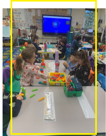
Kindergarten Fine Motor Center Materials