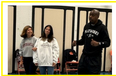
Playworks Staff Training