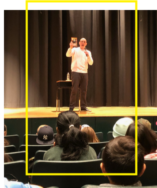
Gordon Korman Author Visit